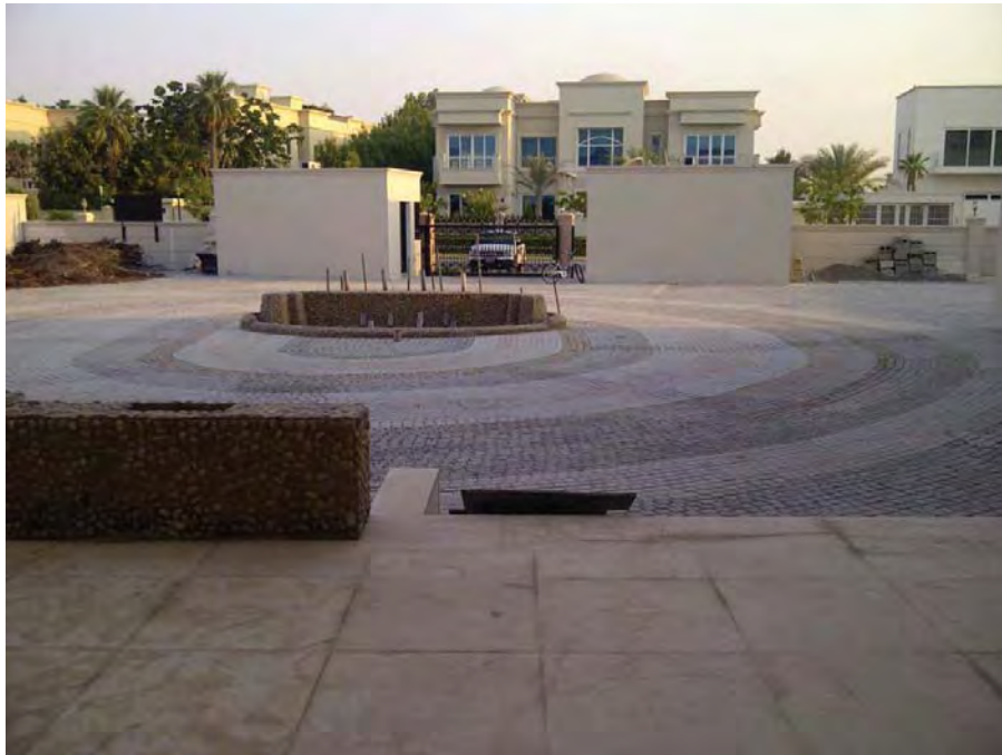
Project:- G+1 Luxury Villa (No L 31) at Emirates Hills Dubai, UAE.