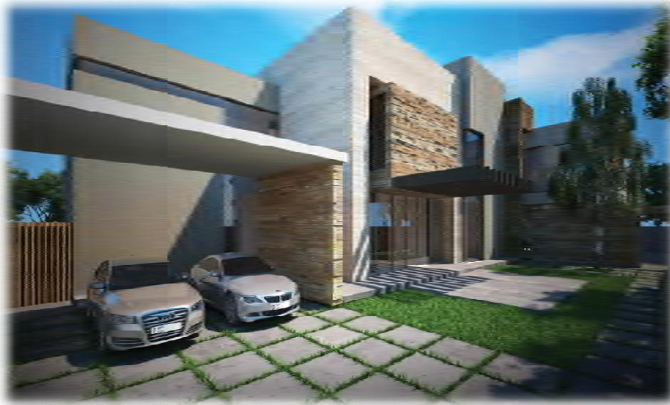
Project:- LG+G+1 Luxury Villa on Plot No 367- 2534 at umm Al Sheif, Dubai, UAE.