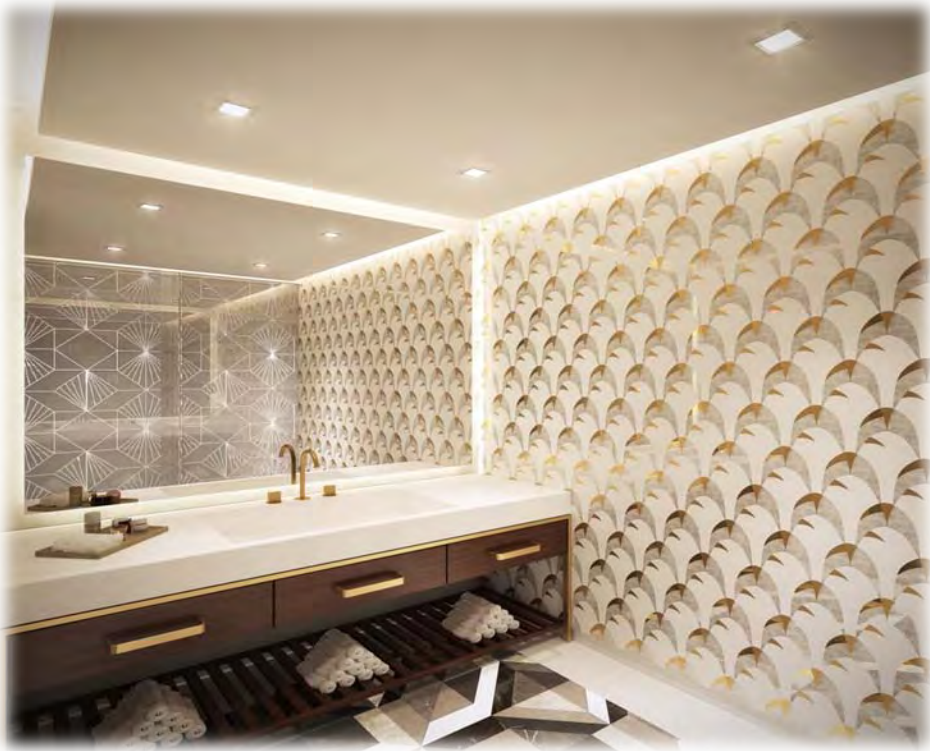
G+1 Private Villa at MBR City, Dubai, U.A.E