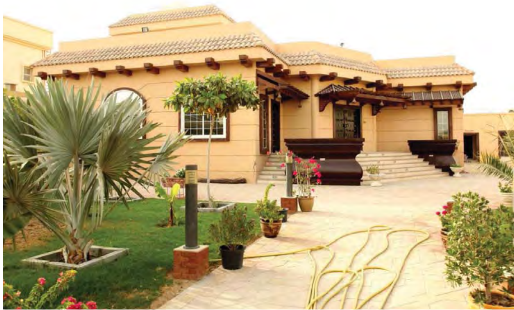
Project:- G+1 Luxury Villa at Mankhool Dubai, UAE