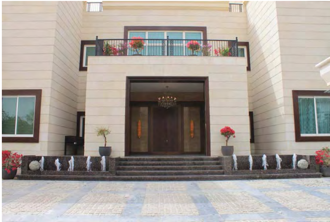
Project:- G+1 Luxury Villa (No HT 14) at Emirates Hills Dubai, UAE.