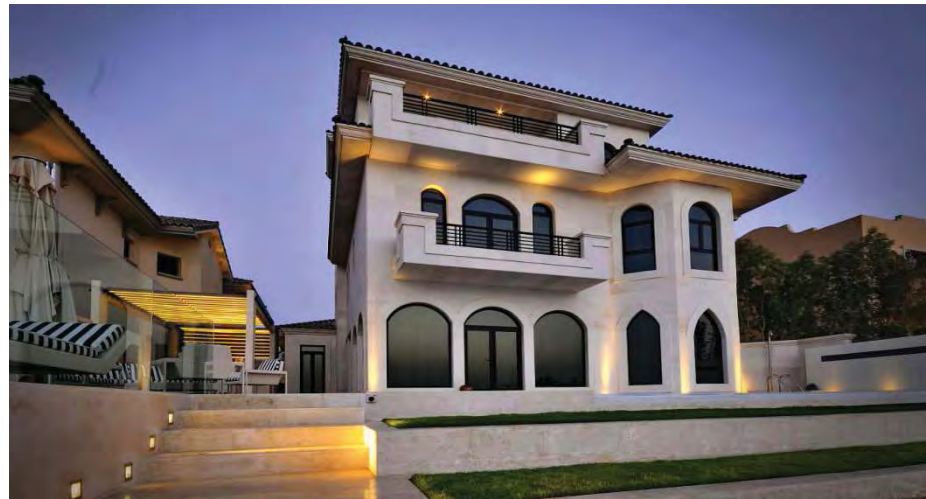
Project :- G+1 Luxury Villa at Palm Jumeriah, Dubai, UAE